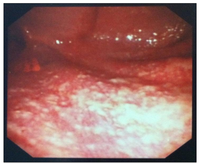
Figure-1: Medical thoracoscopy view of parietal pleura in patient with tuberculous pleural effusion

Iran seems to have a lower number of tuberculosis cases. In one study from Iran, a one-year period data were collected from 213 patients referred for pleural effusion. Tuberculosis was the third most common etiology of pleural effusion accounting for 5.2% of the total cases.<sup>[5]</sup>